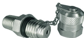
B Series Sample Valve